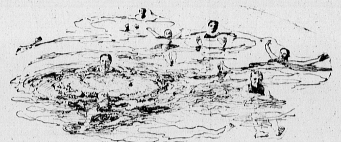
BATHING IN LITTLE MANITOU LAKE

Anticipating the enormous demand for the mineral water of this lake as soon as its great curative powers are made known, a Company with strong financial backing has been incorporated (Manitou Mineral Water Company, Ltd., Winnipeg, Man.), and is now bottling and shipping the mineral water to all parts of the American continent. There are also two other companies being organized to bottle and ship the wonderful water from Little Manitou Lake. These water companies will be of great advertising value to Watrous, and will make this beautiful little city known throughout the American continent.