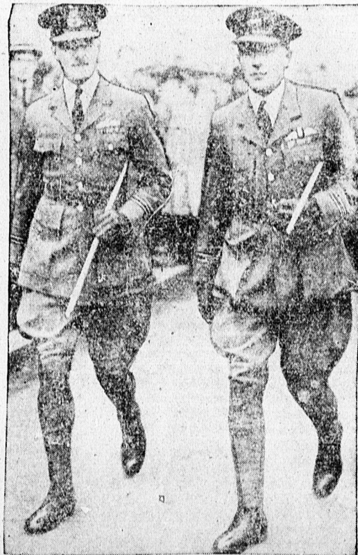
HONORED BY KING AT BUCKINGHAM PALACE

Lord Kysant, former chairman of the Royal Mail Steam Packet Co. and a dominant figure of the British shipping world, has started to serve a 12-month sentence in prison for falsifying the company's financial statements. He is seen leaving his London home.