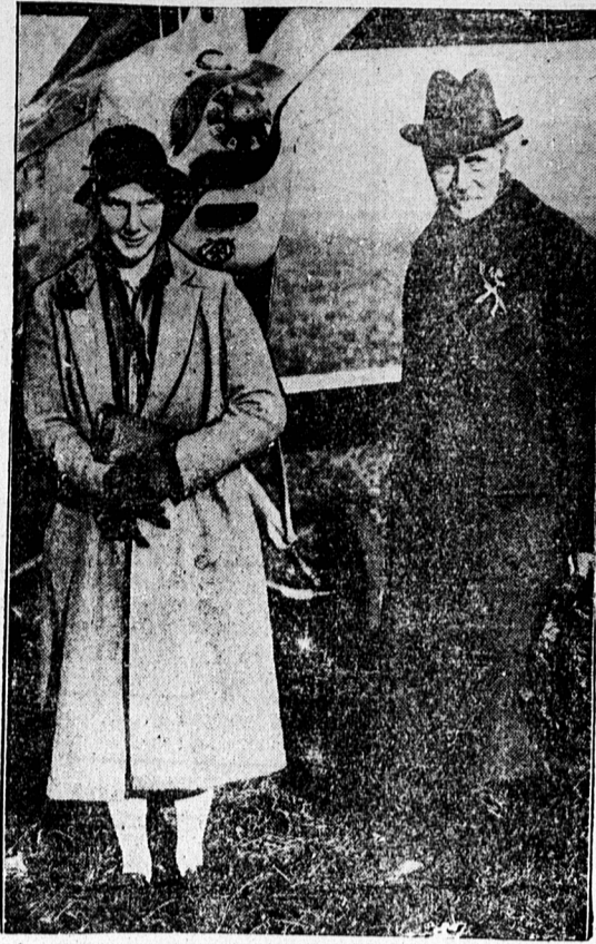
USES AEROPLANE IN TRAVELS ABOUT COUNTRY

The stern of the new mammoth French Line flagship—still unnamed and known only as the "T-6"—photographed recently at the Penhoet shipyards in St. Nazaire, France, where the liner is being built. The liner will be launched next summer, and enter service in the spring of 1934. The scene here does not appear any more pretentious than the steel-work of a new skyscraper.