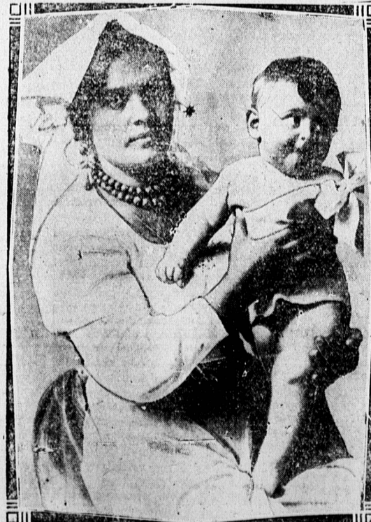
SPENDS HOLIDAYS AT GENOA

Here are Princesses Teru and Taka, daughters of the Emperor and Empress of Japan, photographed during their initial excursion to the Tokio Zoo. Princess Teru, aged six, is on the RIGHT. Both little girls were as highly excited as any other youngsters their ages in spite of the restrictions imposed on royal children.