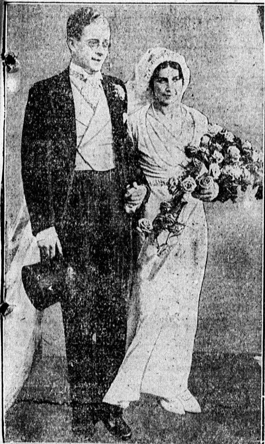
WED IN LONDON, ENGLAND, CHURCH

Wading through water as well as land, a new type tank has been perfected by a British concern which promises to revolutionize tank warfare. In the water, the tank is half submerged, and is driven by a propeller and steered by a rudder, both of which are so placed that they are not damaged when travelling on land.