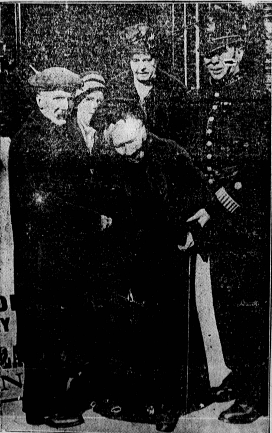
IN BRITAIN'S CRISIS