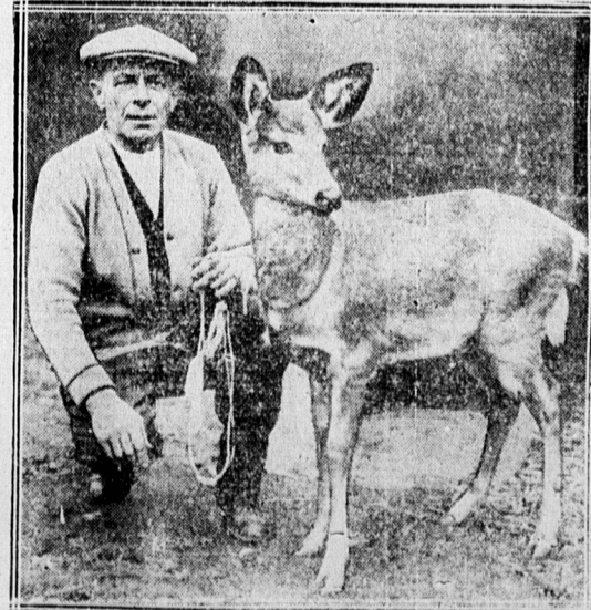
COMES SOUTH TO SPEND THE WINTER