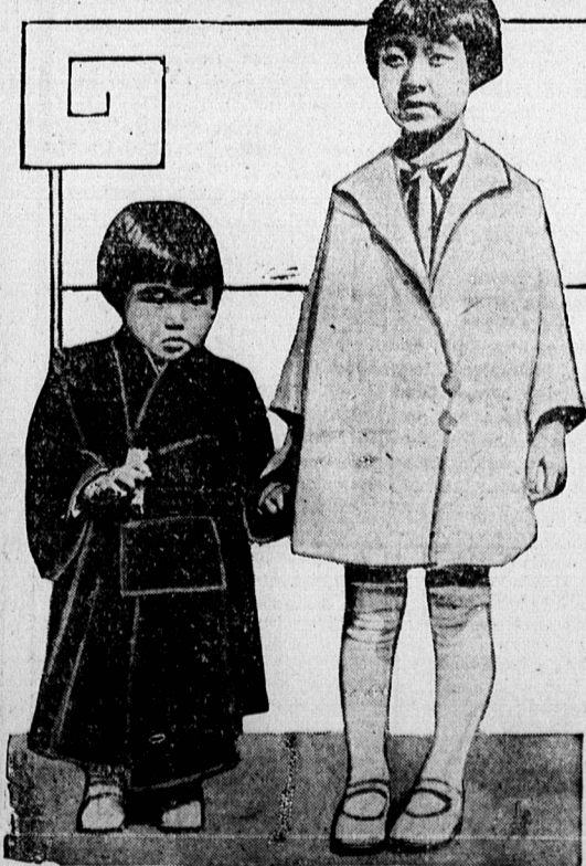
JAPANESSE PRINCESSES AT ZOO