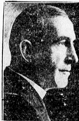
CHOICE FOR NEW POST

Flight Lieut. Stainforth (LEFT), holder of the world's air speed record, and Flight Lieut. Boothman (RIGHT), winner of the Schneider trophy, received the Air Force Cross from the King at Buckingham Palace. They are seen arriving.