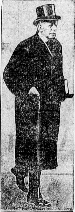
PEER ENTERS PRISON