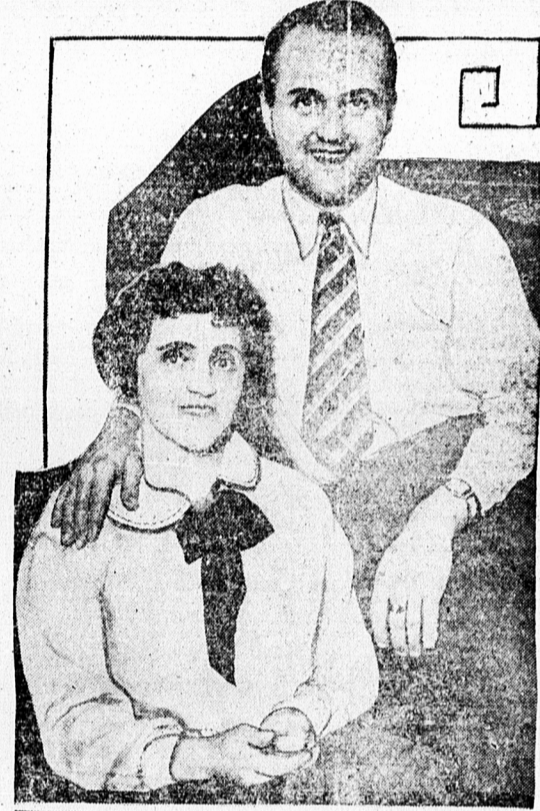
MISSING BALLOONIST HOME AGAIN