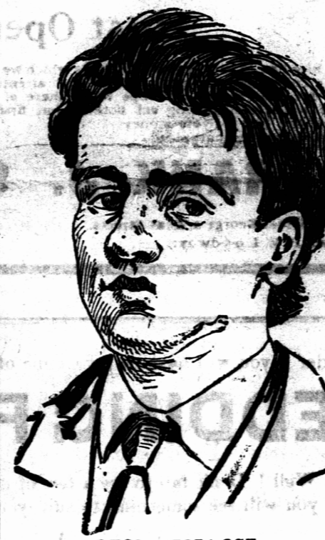
LEON UZOLGOSZ, The Anarchist who shot President McKinley.

CHICAGO MARKETS. Chicago, Sept. 17.—(Special)—The following are the closing rates: Sept. Wheat 69; Corn 58; Oats, — Pork $14.90. Dec. Wheat, 71; Corn 60; Oats, — Pork $16.02. Jan. Wheat, 75; Corn, 62; Oats, — Pork —