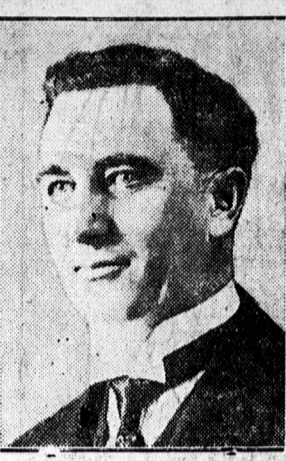
Who is likely to succeed Sir James Lougheed, as leader of the Conservatives in the Senate.