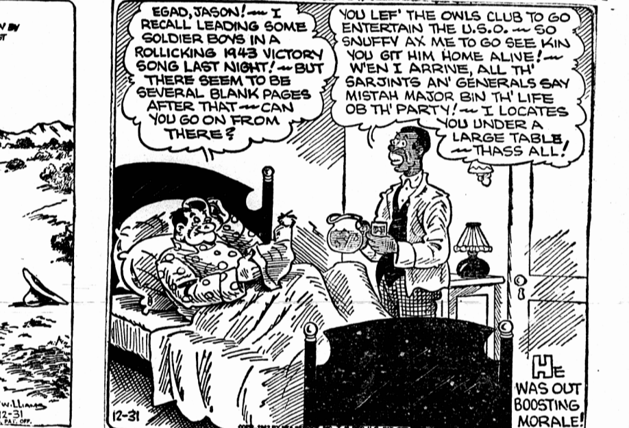
WE WAS OUT BOOSTING MORALE!