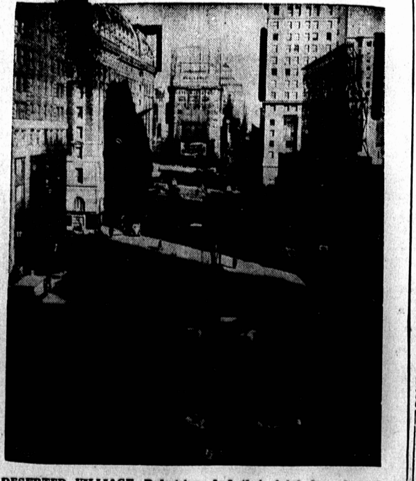
DESERTED VILLAGE—Pedestrians had their brief day when thousands of motorists were stymied by the ban on passenger-car driving in the 17-state east coast area. Pictured above is the scene in Times Square—"Cross-Roads of the World"—which, on the last Saturday before Christmas, normally would be jammed with traffic.