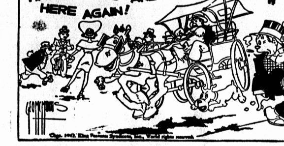
HAPPY DAYS ARE HERE AGAIN!