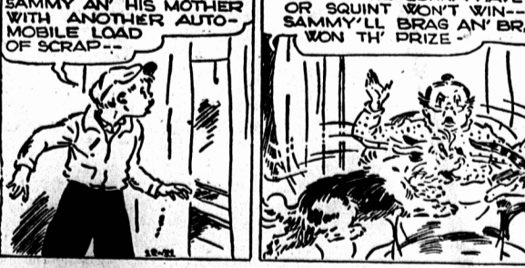
THEIR BRAINS ARE IN THEIR FEET.