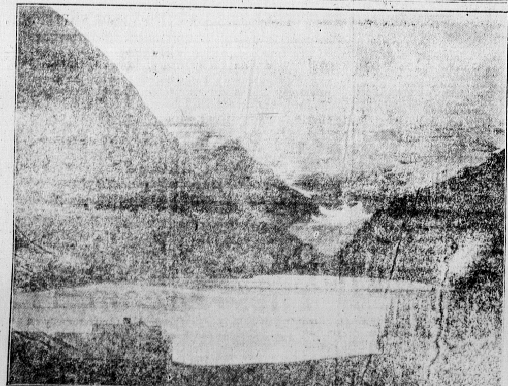
LAKE LOUISE—One of the Beauty Spots in the Mountains on the Western Route of the C. P. R.

Pure Gossile Soap made from first pressure Olive Oil and chemically pure lard by Olive Grocers Association of Marseilles, France. We especially recommend this brand on account of purity and freedom from excess of alkali. Price 20c pound. The Best Drug Store, The MacKinnon Drug Co., Druggists, Cor. Gt. Geo. & Kt. Sts.