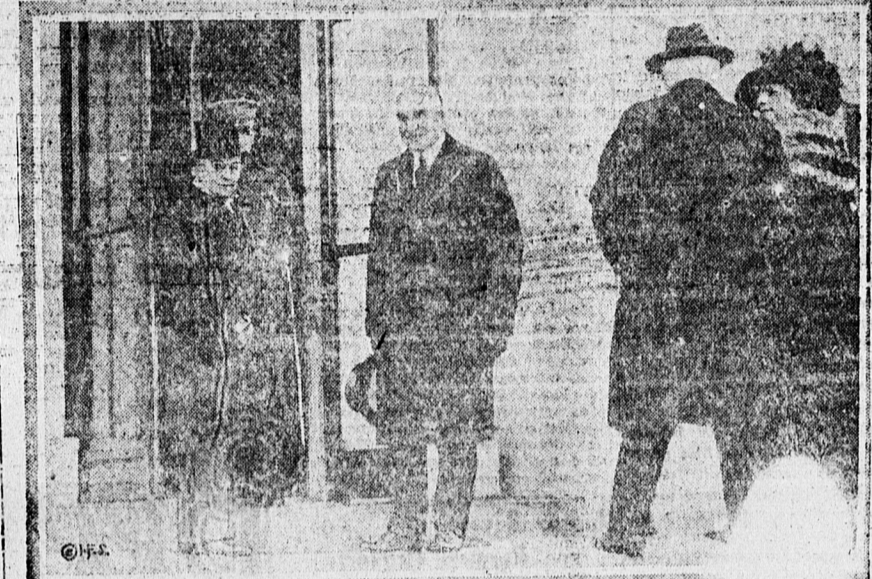
President and Mrs. Harding Entering the White House

CALEDONIAN CLUB The Veterans Association has received a donation of $35.00 towards their Building Fund from the Caledonian Club.