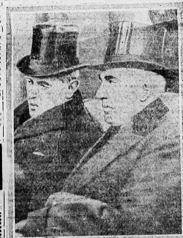
Old and New Presidents on Way to Attend Inaugural Ceremonies

The Empire's Concern: We are glad to see that an Imperial Conference is to be held in the coming summer, and as Egypt is, as it were, the waist of the wasp.