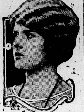
Marjorie Daw in the Gramophone Picture "The Pride of Palomar" A Cosmopolitan Production

But if it were put to a vote in Peckham the populace would plump for Solomon with appropriate scenery.