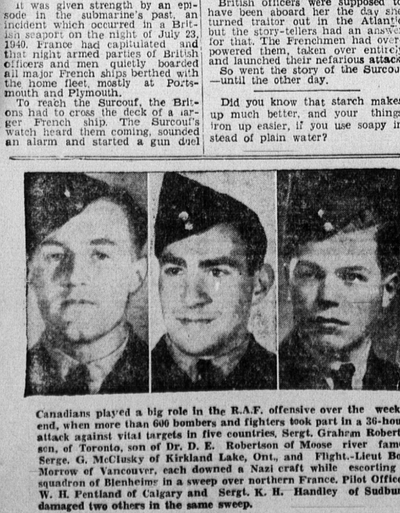
Canadians played a big role in the R.A.F. offensive over the week-end, when more than 600 bombers and fighters took part in a 36-hour attack against vital targets in five countries.

(By The Canadian Press) OTTAWA, Oct. 1.—One of the war's better fables was shot full of holes the other day when an official announcement revealed that the Free French submarine Surcouf was tied up in an American harbor. "The Surcouf was sunk" off the Atlantic seaboard of Canada weeks ago. "Out of a mysterious nowhere there came a fabulous story of this world's largest undersea craft, turning on the convoy of British and allied merchantmen she was charged with protecting. Her vessel was supplied with provisions and fuel by a secret ship after ship to the bottom. Even, possibly, she was being fed in the throes of death before the concerted fire of other ships in the convoy mortally wounded the traitor herself."