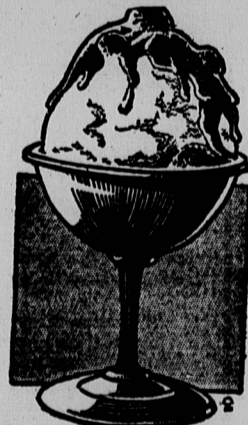
"A Dream of Fruit and Cream"

That absolutely peerless Ice Cream called PERFECTION the creamiest, tastiest, purest dessert on the Island. In summer especially it's the Premier Palate-pleaser. Offered in several dainty flavors.