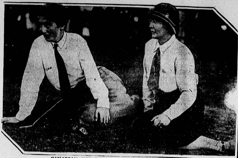
CANADIAN AND ENGLISH WOMAN GOLFERS