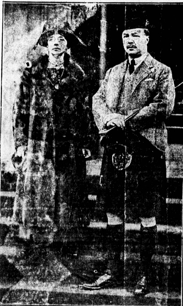
The Duke and Duchess of Atholl

MOORE & McLEOD LIMITED 119-121 QUEEN STREET, CHARLOTTETOWN