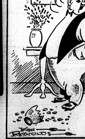
"I knew why you won't rent our spare room with a Guardian Want Ad—you want your mother to use it and force me to fight on two fronts!"