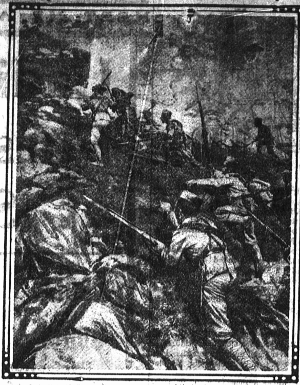
Japanese Storming Old Stone Fortress near Hai-Cheng