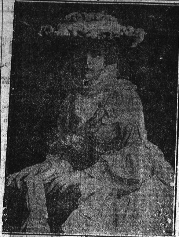
COUNTESS BEAUCHAMP. This beautiful English peeress the wife of Lord Beauchamp, Captain of King Edward's corps of Gentlemen at Arms, has been chosen by the British Government as its official hostess to entertain the Colonial premiers. Her idea of a party at Lady Beauchamp's country seat, the Countess will receive the guests at the great reception to be given at the Colonial Office.