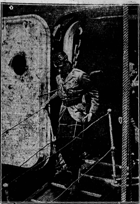
His Royal Highness stepping from the Canadian Pacific S.S. Empress of Australia at Quebec.

"This record not only shows a deep interest in the upbuilding of the country; it shows that the membership of the Senate is thoroughly imbued with the spirit of progress and national development of our country. In our opinion it speaks loudly for the personnel of the Senate, and should make people stop and think before pronouncing the sentence of death on that chamber."