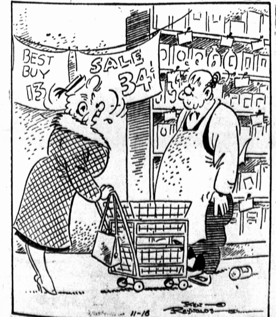
"Can I borrow it for a while — I want to answer some Guardian Want Ads?"