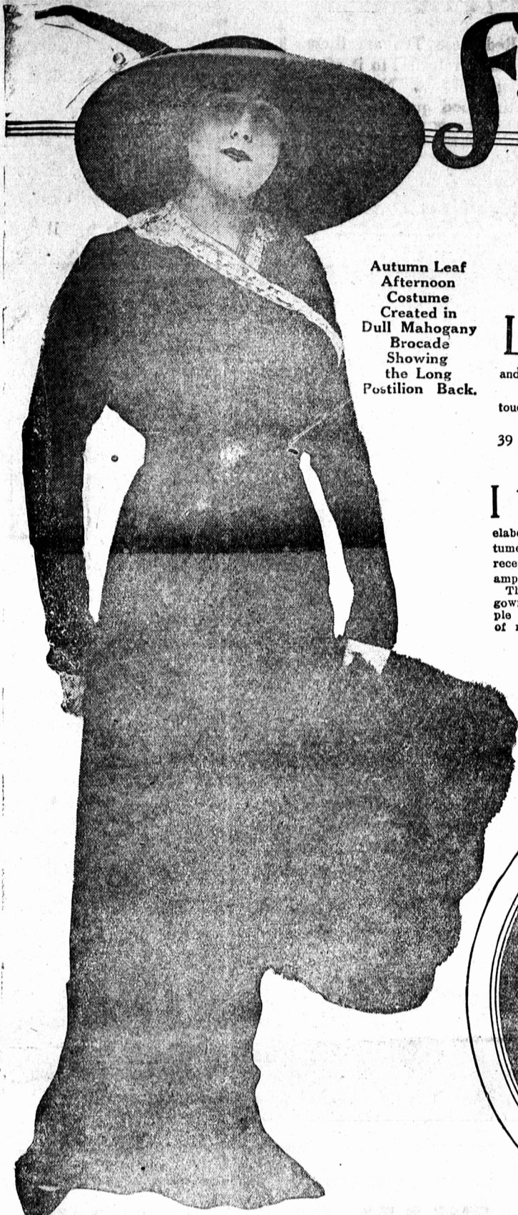
Autumn Leaf Afternoon Costume Created in Dull Mahogany Brocade Showing the Long Postilion Back.

Elaborate Evening Gown of White Crepe Charmeuse, the New Train and Sash Girdle.