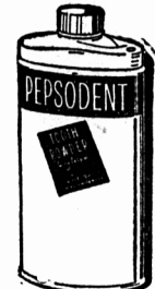
It's IRIUM that makes the difference

"Because I changed to Pepsodent Tooth Powder WITH IRIUM!"