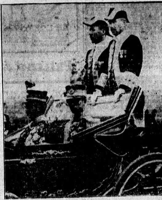
Their majesties, Emperor Hirohito (LEFT) of Japan, and Emperor Kang Toh of Manchukuo, photographed in the royal Japanese carriage as they passed between long lines of Jap troops at Yogi when they reviewed a tremendous display of Oriental strength. More than five thousand of the finest Japanese troops, as well as over 100 airplanes of the Tokorozawa and Shimishima military aviation schools, flew over the parade ground.