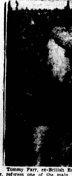
Tommy Farr, ex-British Empire champion boxer, referees one of the main bouts of the Boxing Show staged by the Canadian Central Ordnance Depot in England. "Break it up," he shouts to Gunn-