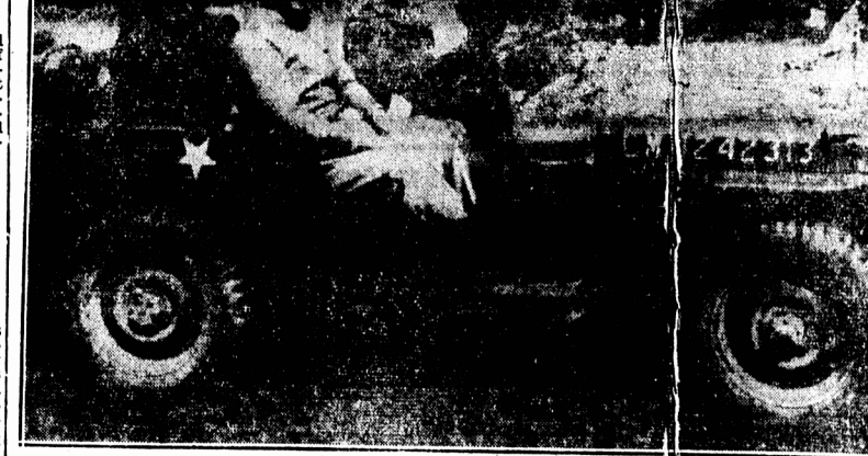
General Montgomery having arrived by his own plane to attend an Army and air staff conference is driven off the field by Lt.-Gen. Crerar.