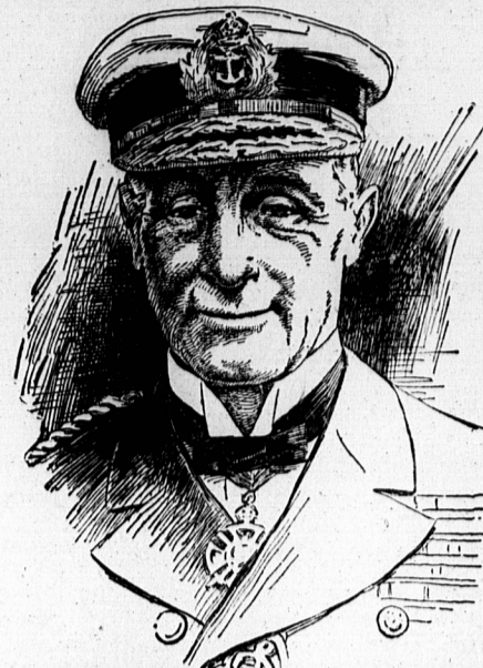
Earl Jellicoe C.C.B. O.M., G.C.V.O., D.C.L., L.L.D., etc.