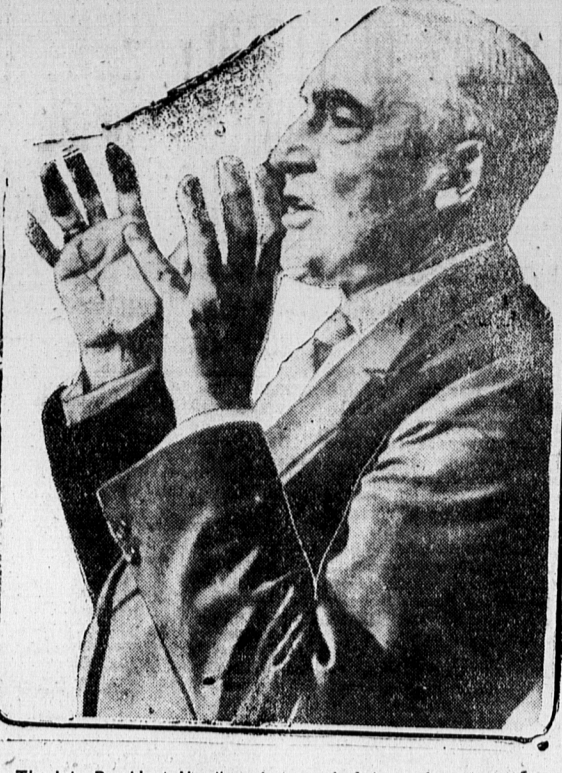
The late President Harding photographed in a characteristic speaking attitude during the tour which resulted in his death.