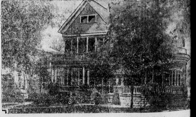
Residence of the late Warren G. Harding in Marion, Ohio, showing the famous "front porch" from which the deceased president conducted his campaign in 1920.

LONDON, Aug. 9.—Charming her husband with a love cake, a Venetian woman was seduced that she was a quality she made for "love" a quality of human bones, which a fortune-teller advised her to give as a love-restorer. She was so jealous of her husband that she despised she went to the "love an." Her mother, wife of a man in a village near Vienna, for her the human bones of a village churchyard. She dug up in the presence of the teller, who murmured prayers incantations by the light of moon. Her husband's first cake he tasted so that he complained about it. He was so embarrassed that came suspicious, and as felt sick he went to the doctor. Her confession having been confirmed by analysis, the woman has been released. She had been built on a situation Orange, exposed to all the of Heaven.