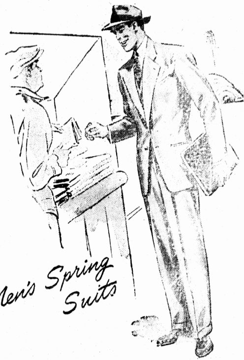
Men's Spring Suits

Here is the Coat with a future. The smartest man's outer Coat for years. Superbly styled and tailored by skilled craftsmen to combine masculine smartness with practical 'tween season comfort. Truly a gentleman's coat, all sizes at $45.00 each.