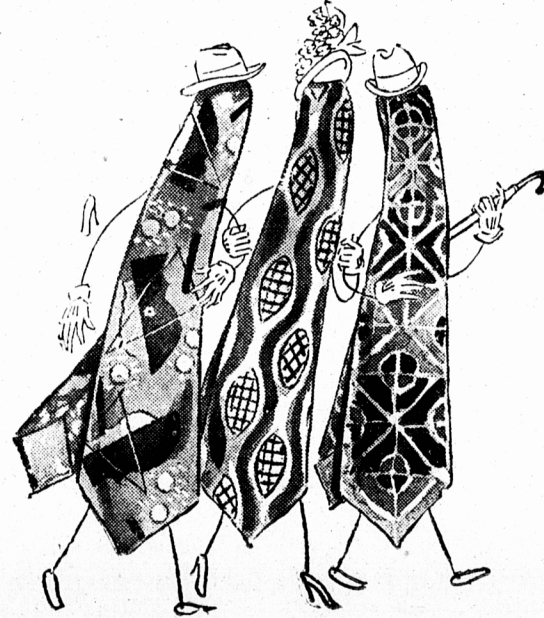
One Touch of Color

What man ever has enough socks. Give him a pair of socks and you'll really make a big hit with him. Conservative designs as well as brighter shades, in suitable weights. All sizes. Priced 65c and up.