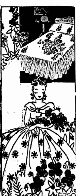
DESIGN NO. E-750

This quaint lady in her gay flower garden will lend beauty to your spread. Hot iron transfer pattern No. E-750 contains 2 motifs 7 1/2 by 7 and 10 1/2 by 12 inches with 50% spray and complete instructions. Needlework Book 20 cents.