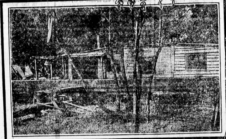
Making a Home of a Mud Scow Foundation.

Just how a houseboat may be arranged as a convenient summer floating home is told here by a woman who has passed more than one hot season in such delightful outings on Maine rivers.