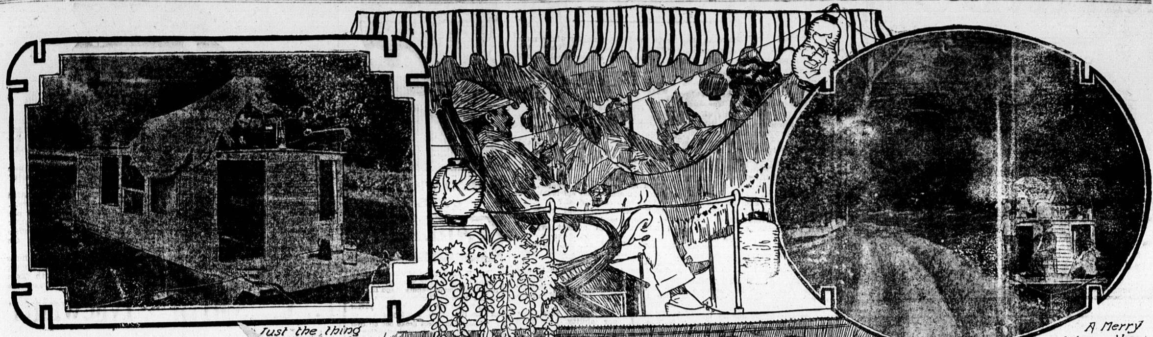
Just the thing for a Bachelor Outing.