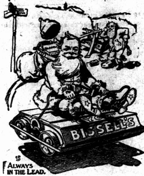
IS ALWAYS IN THE LEAD.

There's a little doll city in our doll-baby bazaar, inhabited by midgets of people from all parts of the doll world. Do you remember the giant whom Jack killed who had a scrolling face on one side of his head and laughter and dimples on the other? Well, there's a dollie here just like that.