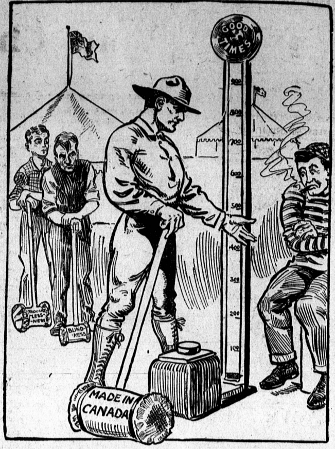
IT DEPENDS ON THE HAMMER

Furnished by W. S. Louson IF WE ONLY UNDERSTOOD. By Rudyard Kipling. If we knew the cares and trials, Knew the efforts all in vain, And the bitter disappointment, Understood the loss and gain— Would the grim, eternal roughness Seem—I wonder—just the same? Should we help where now we hinder? Should we pity where we blame? Ah! we judge each other harshly, Knowing not life's hidden force— Knowing not the fount of action Is less turbid at its source; Seeing not amid the evil All the golden grains of good; And we'd love each other better If we only understood. Could we judge all deeds by motives That surround each other's lives, See the naked heart and spirit, Know what spur the action gives, Often we would find it better, Purer than we judge we should; We would love each other better If we only understood.