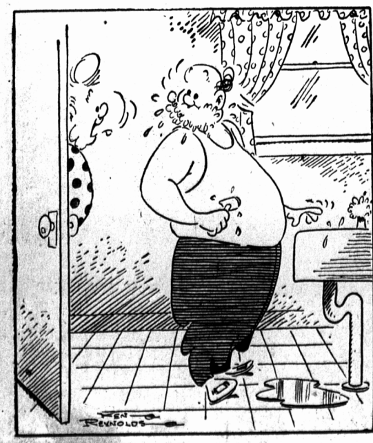
"The canary we got with a Guardian Want Ad would like to know the name of the tune you were singing!"