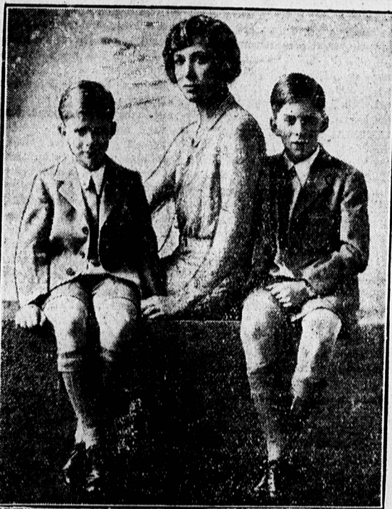
Reproduced ABOVE is a new and interesting portrait study of Princess Mary, Countess Harewood, and her two sons, Viscount Lascelles and Hon. Gerald Lascelles.