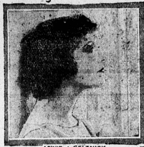
LEWIS & BELZONICK PRESENT CONSTANCE TALMADGE "ROMANCE AND ARABELLA" SELECT PICTURES

Is the Girl you Love Romantic? Are you Prosaic? Do you want to know how to win her despite her love for romance? See Constance Talmadge in Romance & Arabella