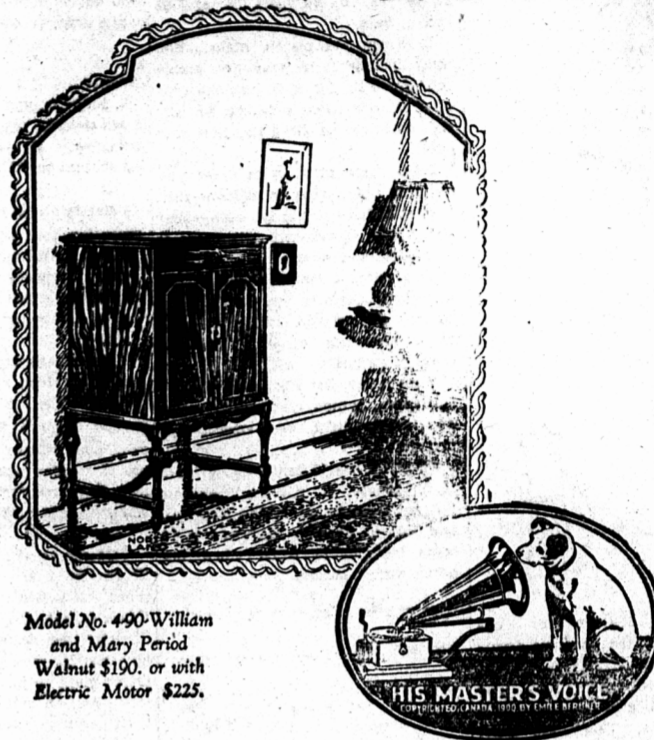
Model No. 490-William and Mary Period Walnut $190. or with Electric Motor $225.

Sweet music gently playing, soft woods warmly glowing in the lamplight. Home, — a chair that's easy, and a Victor record library to choose one's pleasures from. Music with all its truth of tone retained. Wonderful instruments from $95 up, and the unequalled Victor Record library to choose your music from. Records stop automatically when through playing. At all authorized Victor dealers. Convenient terms.