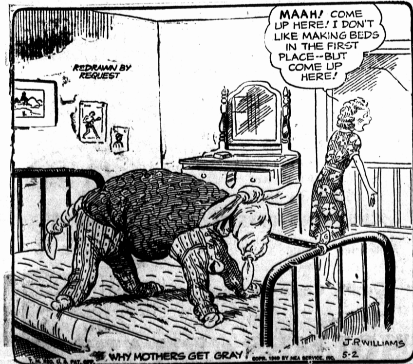
WHY MOTHERS GET GRAY! © 1949 BY NEA SERVICE, INC. 5-2

with the last 100 years, tells us that the crofter counties cover 47 per cent of Scotland's land area but contain only 300,000 people—less than six per cent of Scotland's population and 96,000 fewer than they supported in 1841. Since 1871 the Highland population has fallen by 76,764, whereas that of Scotland as a whole has increased by 1,856,000. (Part of the increase is due to an influx of Irish laborers to the industrial areas—an influx little appreciated by the original Scots!) The immediate object, in attempting to solve the problem, is to increase the national food supply, but the task is no easy one due to the crofting system "which perpetuates in legal form a highly involved version of peasant tenure which has no counterpart anywhere else in the Commonwealth."