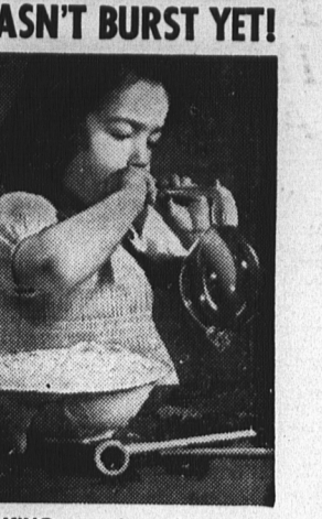
HASN'T BURST YET! MAKING a mess for mother to clean up again. Where does she get all her zest? Wise mother knows... big bowl of Kellogg's Corn Flakes with milk and sugar gives her needed food energy. And does she love it! Can't get enough! This year, again, all across Canada, thousands vote Kellogg's Corn Flakes their favourite breakfast. Order several packages today!