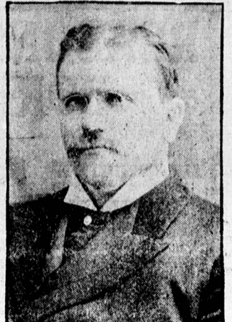
HON. L. P. BRODEUR, Minister of Marine and Fisheries.