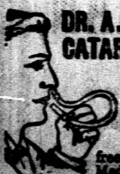
DR. A. W. CHASE'S CATARRH CURE... 25c.

If you take a Laxative Pill to-night before retiring, it will work while you sleep without a gripe or pain, curing biliousness, constipation, dyspepsia and sick headache, and make you feel better in the morning.