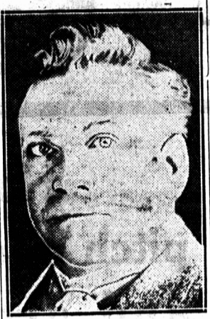
ADDRESSES ADVERTISERS Lord Leverhulme, the 73-year-old soap king, who addressed three thousand delegates at the International Advertising Convention being held in Wembley by the Associated Advertising Clubs of the World, Lord Leverhulme has business enterprises all across Canada.