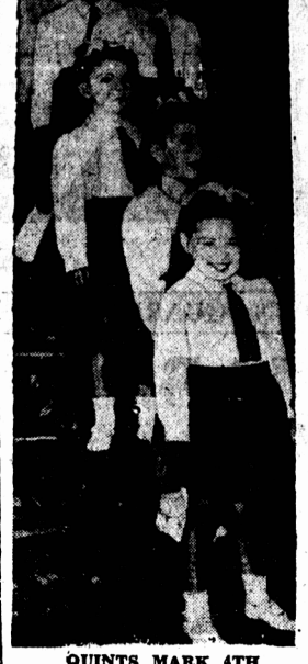
QUINTS MARK 4TH BIRTHDAY