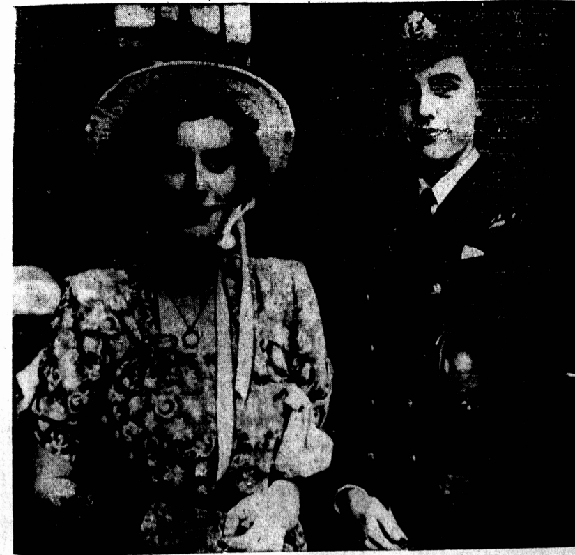
Probable bridesmaids for the wedding of Princess Elisabeth and Prince Philip are his cousins, the two daughters of Viscount Mountbatten and Lady Mountbatten, Pamela, 17, on left, and Patricia, 22, Patricia was recently demobilized from the WRENS.

Charlottetown and North Westville Phone 16