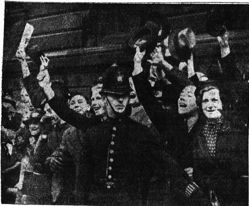
A few years ago scenes like this picture above would have been impossible, but times change and here you see Premier de Valera of Eire being cheered by London crowds. The occasion was the signing of the new agreement between England and Eire in London.