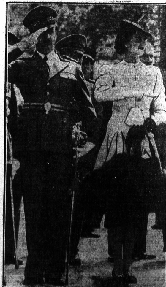
Paris fashion experts worked overtime to provide the trousseau for Queen Geraldine of Albania. Style scouts noted this far-trimmed coat with interest when she and the King reviewed the army. As the troops marched by their new queen greeted them with the Albanian national salute.