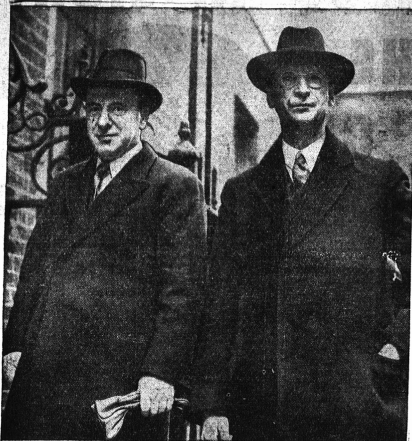
Mr. de Valera and Mr. Dulanty, High Commissioner in London, picture here arriving at Downing street where they signed the new England-Eire agreement.