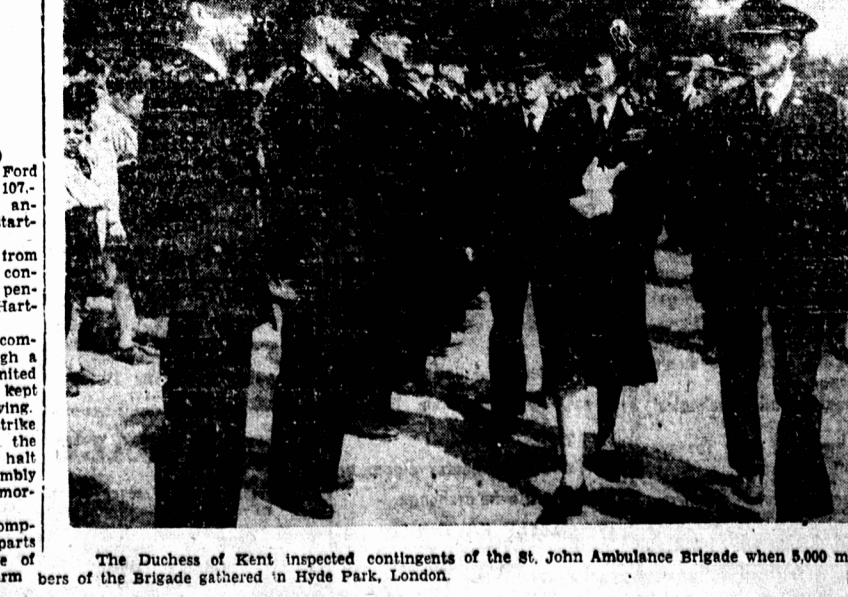
The Duchess of Kent inspected contingents of the St. John Ambulance Brigade when 5,000 members of the Brigade gathered in Hyde Park, London.