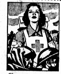
Give—HUMAN SUFFERING IS GREATER THAN EVER NOW!

The need was great last year. It's infinitely greater today. YOUR Red Cross dollars must keep up the work. Give fully!