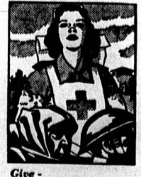
Give—HUMAN SUFFERING IS GREATER THAN EVER NOW!

PROWSE BROS., Ltd. Dry Goods, Clothing, Men's Wear, Millinery, Charlottetown