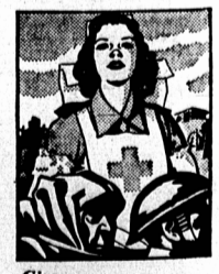
Give—HUMAN SUFFERING IS GREATER THAN EVER NOW!

CANADIAN RED CROSS $10,000,000 Needed Starts Monday, Feb. 28 KENNEDY'S LADIES' WEAR