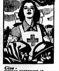
Give—HUMAN SUFFERING IS GREATER THAN EVER NOW!

CANADIAN RED CROSS $10,000,000 Needed Starts Monday, Feb. 28 JOHNNY'S MAYFAIR TEA ROOMS