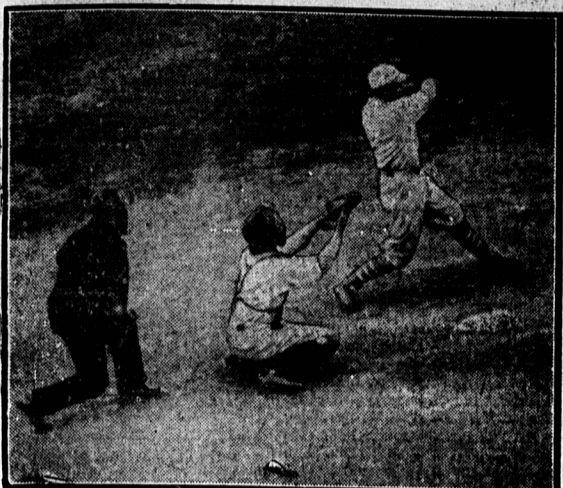
FOXX Slugging youngster of the Athletics is shown at the bat as he delivered the mighty swipe which scored two runners in front of him and literally broke the hearts of the Cubs and also broke up old ball game at Chicago. It was in the second game of the series.