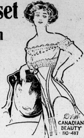
CANADIAN BEAUTY NO. 487