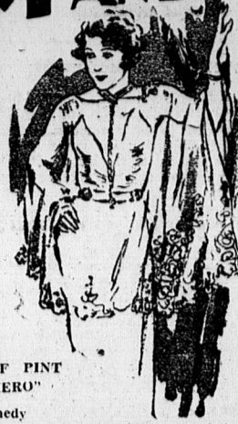
"HALF PINT HERO" Comedy

Love, laughs thrills in a modern Garden of Eden.