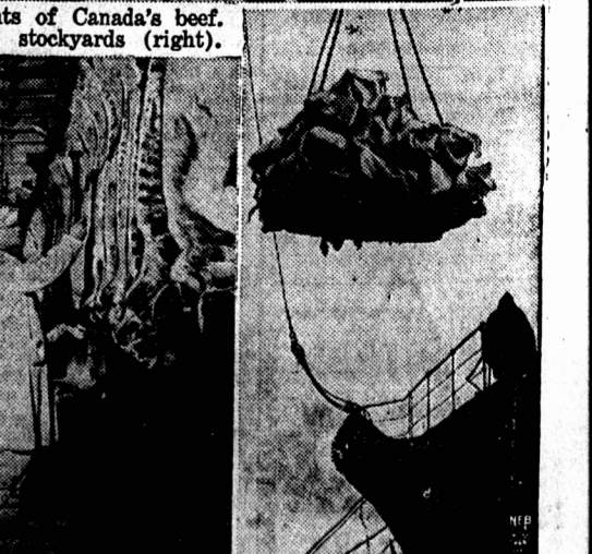
Livestock slaughter control is as important as rationing to equitable distribution of domestic beef supplies. This packing plant worker uses a power saw to halve a carcass.