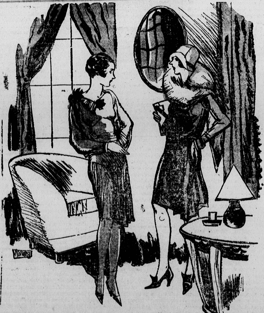
"Your Father is in separate difficulties and something must be done at once."

the headlines in your newspaper clear across the table. There's one headline you haven't said anything about, although you have mentioned most of the others. It's one in the upper left hand-corner—something about the mysterious Mr. Graves. Your mind has been on it all the time although you have kept silent