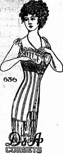
636 D & A CORSETS

400 pairs new model D & A Corsets offered at very special Introductory Discount Prices--See them