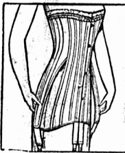
This is the special at 50c each

This Beautiful Corset is made of a splendid quality of French Coutil, low bust, cut very deep over the hip, heavy clasps, hook below clasps to keep corsets from spreading, extra high grade steels, top is plainly but tastefully finished with silk embroidered bias binding, and has draw string to insure that there will be no bulging through the gown at the top. We have never offered a corset at 1.35 any better SPECIAL DEMONSTRATION PRICE..... $1.00