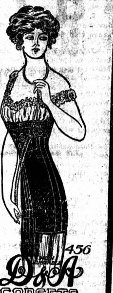
456 D & A CORSETS

YOU know that this store has a reputation all over P.E.I. for its dollar corsets. In this offer we will give you a corset at 79c equal to any previous dollar value. Extra long corset, medium high bust, cut short at front centre, 4 hose supporters demonstration price. .... 79c