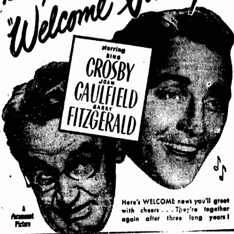
Here's WELCOME news you'll greet with cheers... They're together again after three long years!