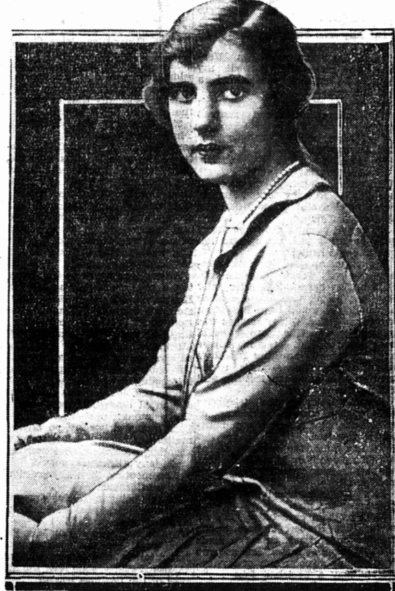
Princess Ingrid of Sweden is said to be the only girl of royal blood whom Queen Mary wants for the daughter-in-law. The name of the pretty princess who is already half-English, is being more and more frequently linked with that of the Prince of Wales.