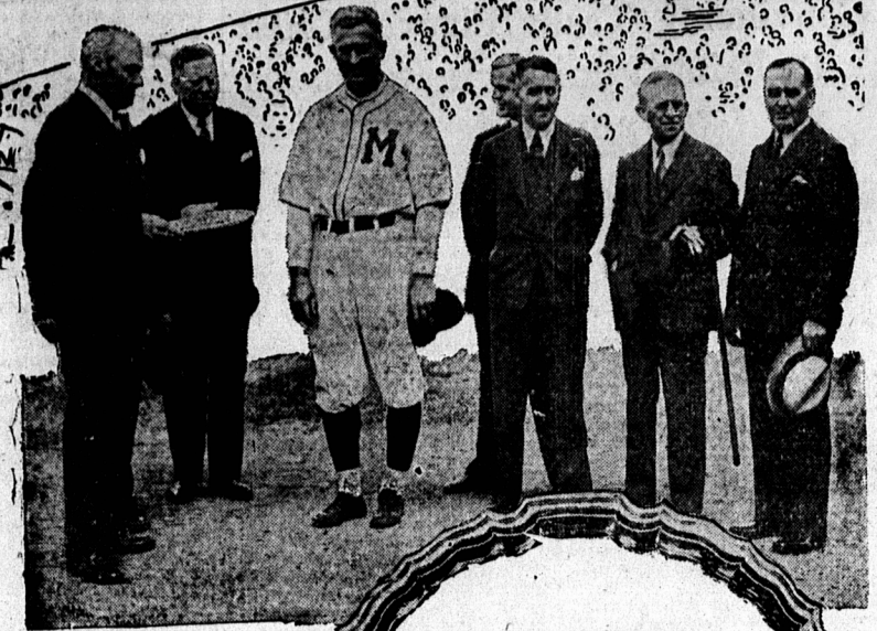
PREMIER HONOURS PENNANT WINNER.